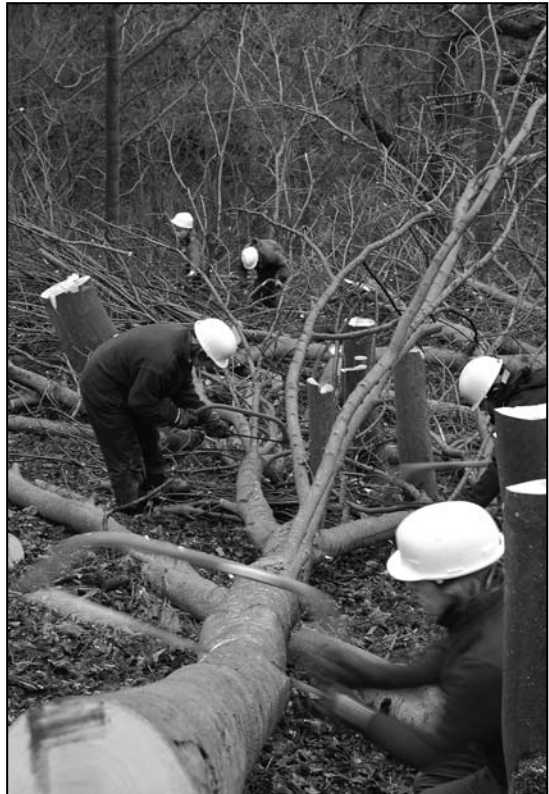
Snedding felled sycamore

Our main difficulty was the dense packing of the trees, resulting in felled trees easily getting hung up on those remaining standing. Use of ropes, levers and the excellent Lug-All winch were needed to bring these trees safely to ground. The stumps were left high for later treatment with arboricide. Once down, a hit squad would sned the side branches quicker than you could open a packet of biscuits for teatime.