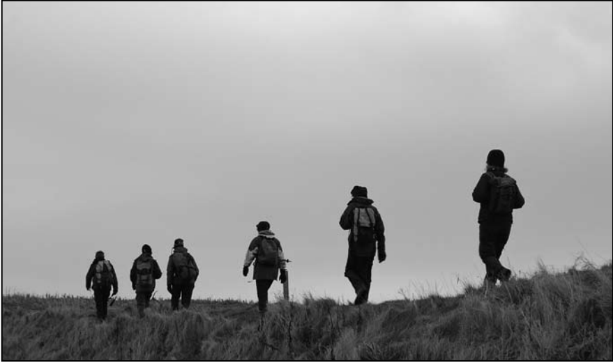
New Year's Day walk along the John Muir Way

Further around the coast at Torness, a flock of goosander were feeding. The path follows the seaward ramparts of the power station where information placards inform us that one quarter of Scotland's peak power demand is met by the Torness reactors. Fish and fishermen make use of the warmer water that is released back to sea after cooling the generators.