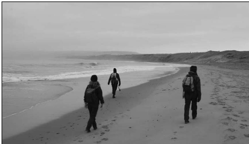
New Year's Day walk along the John Muir Way

On New Year's Day we drove up the coast to Dunbar and walked the John Muir Way coastal path back to Cockburnspath. The route begins at Dunbar's sandstone castle and fishing harbour. Further on through the golf links we stopped at